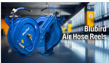
Blubird Air Hose Reel