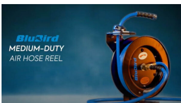
Blubird Reel Introduction