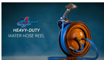
Bluseal Water Hose Reel